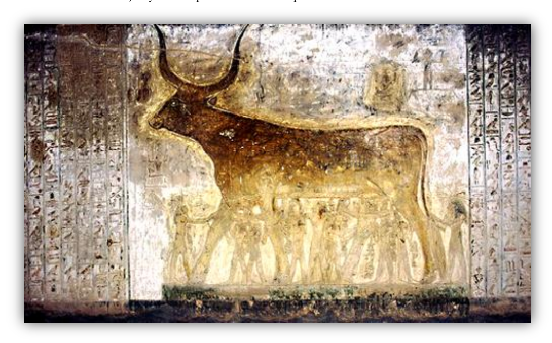
The Sky Ntorot Nut after taking the form of the Divine Cow. Nut surrounds the Earth and the stars can be found within Her heavenly body at night. As a Divine Cow in the Night Sky/ Nut Sky, the milk from Her udders (starlight of the milky way) nourishes us on Earth. The above image is from the Tomb of Seti (KV17). The metut (hieroglyphic text) shown here is one of the source texts for the Emergence of Sekhmet-Het Heru (Book of the Heavenly Cow) "Destruction of Mankind").

The Heavenly Ntorot Nut replied, "But how, my father Nu? "...And so Nut took the form of the Divine Cow in the Heavens. Then the Majesty of Ra placed Himself upon Her back.