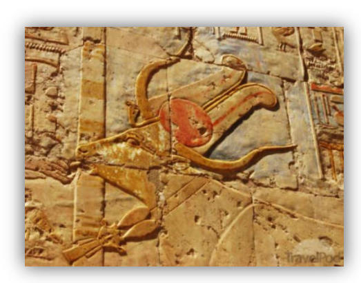
Sekhmet (left) is depicted as a Lioness while Het Heru (right) is depicted as a Cow or a Female with Cow's Horns

In Aamu (region of contemporary kom el hisn), the Per Aa Sen Usarit the First (Pharaoh Senwosret I) built a temple for Sekhmet-Het Heru over 4,000 years ago. Sekhmet and Het Heru were both worshipped at this temple.