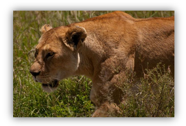
Sekhemet - The Powerful (sekhem) One

And so it happened that this Sekhmet [this powerful (sekhem) One], upon the change of night, waded about in the blood of the men and women She had slaughtered, beginning at the region of Henen Su .