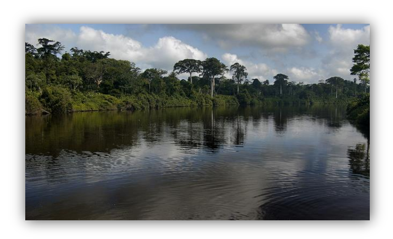
Komoe (Comoe) River Ivory Coast (Cote d'Ivoire), West Afuraka/ Afuraitkait (Africa)

We also see above that Akhm or Akhmt in Kamit is the bank of a river . Over 450 years ago, prior to our migration into the region of contemporary Ghana, the Akwamu were part of the Kumbu ( Kumu ) Kingdom in the Kong area (contemporary Ivory Coast region). At times we lived along the sacred river now called Komo , also written Komoe , Comoe , Comoe , Kumbu ( Kumu , Komo ), as a name of the Kingdom and the river, is etymologically rooted in the name Akwamu as manifest in contemporary Twi and Khmu , Akhm , Akhmut from Khanit and Kamit.