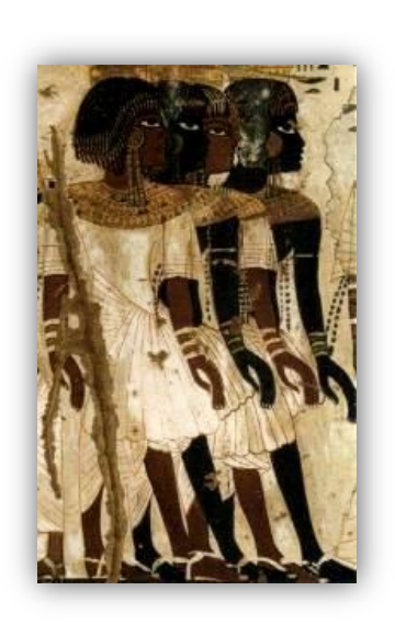
Khanitu - Ancient Akanfo visiting Kamit 3,400 years ago

Akanfo (ah-kahn'-foh) in the Twi language of the Akan means Akan people . Akanfo originated in ancient Khanit , also called Keneset (Ancient Nubia), at the beginning of human existence upon Asaase (Earth). This is the region of contemporary Sudan and South Sudan in the Eastern region of Afuraka/Afuraitkait (Africa). We eventually migrated around the world. Some Akanfo migrated north of Khanit and settled ancient Kamit (ancient Egypt), while others remained in Khanit. Over the millennia, Akanfo migrated to West Afuraka/Afuraitkait (West Africa) establishing the ancient civilization of Akana (Khanat - Ghana). Some Akanfo were also a component of the Kanem empire (pre-Bornu), the original/authentic Black Berber empire ( Abibiri- fo) and the Kong empire (Kan) before ultimately migrating to and settling in the areas of contemporary Ghana (Akana) and Ivory Coast . Akanfo presently comprise approximately 45.3 percent of the population of Ghana (11,000,000) and approximately 42.1 percent of the population of Ivory Coast (9,000,000). Collectively, there are over 20,000,000 Akanfo in West Afuraka/Afuraitkait, including smaller populations in Togo, Burkina Faso and other areas.