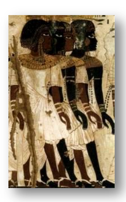
Akan – The People of Khanit (Akan Land – Ancient Nubia/Sudan)