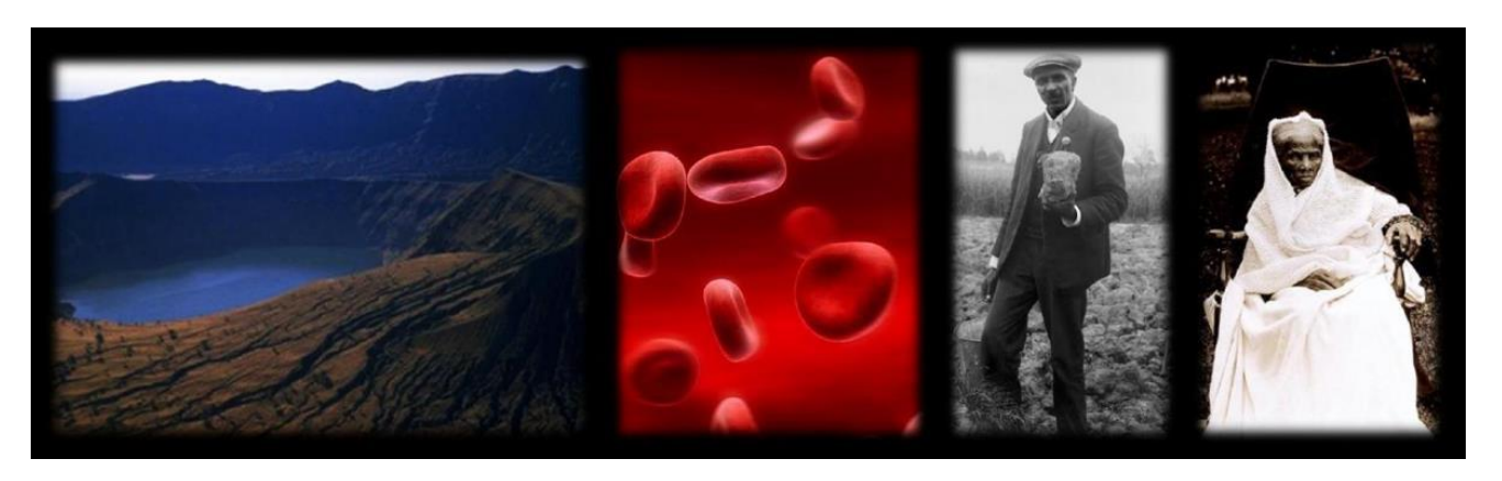
Marra Mountains in Sudan (Khanit), Nana Kwame Afrani (George Washington Carver) and Nana Abenaa Araminta (Harriet Tubman). Soil to Soul – Afurakani/Afuraitkaitnit (African) Ancestral Religion in the Blood.

Afurakanu/Afuraitkaitnut (Africans) worldwide, because of our shared experiences and blending of blood-circles spiri-genetically. We have the capacity and responsibility today to complete the process of Nationbuilding/Restoration begun by our Aakhu/Aakhutu (Spiritually Cultivated Ancestresses and Ancestors) - the attainment of our complete independence as a self-governing nation, on our own territory and secure in the absolute defense of our sovereignty. This capacity is founded upon our realigning ourselves, purifying ourselves, through adherence to our Afurakani/Afuraitkaitnit Ancestral Religion and Culture. It is in our souls and blood. This is our transcarnational inheritance as Afuakanu/Afuraitkaitnut (Africans~Black People) in the west, the purified nation, Odwiraman.