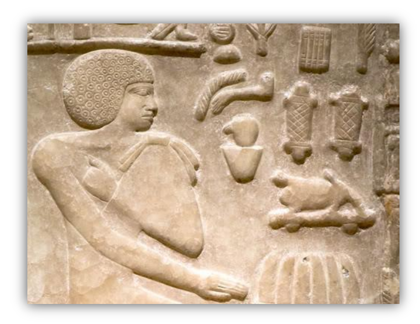
Stela of Abneb - Sakkara