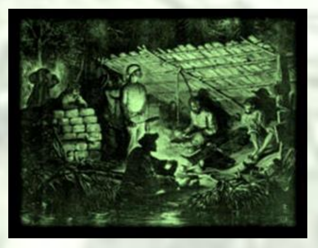
Born of the Spiri-Genetic Blood-Circles of Afurakanu/Afuraitkaitnut (Africans) in North America