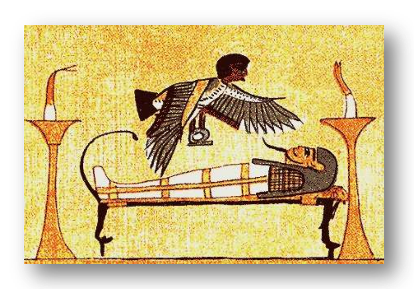
Ba - The life-spirit which animates-possesses us

Akom and Nkom are Akan terms for Spirit-possession and Spirit-communication . Spirit-possession and Spirit-communication are central to Afurakani/Afuraitkaitnit (African) Ancestral Religion. Those who do not communicate with the Abosom and Nananom Nsamanfo, Orisha and Egungun, Vodou and Kuvito - the Deities and Ancestral Spirits of our direct blood-circles - have no real knowledge of cosmology.