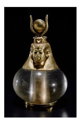
Het Heru (the Obosom Afi/Oshun) - Napata Period, Ancient Khanit

We thus have in the Twi language kan meaning to count, to reckon as well as first, foremost . We also have Khanit , Khan , meaning first, foremost, forerunner, south (head, first) and Khan (Than) meaning to count, to reckon . This is the same word in both languages with both meanings in both languages transmitted from ancient Khanit (Nubia) to contemporary Akanni culture without alteration. These terms define the nature of the Akan people. In concert with our cosmology, language, cultural and ritual practices these definitions establish the Akanni people as the Khanit people - the ancient Kenesu , Nubians .